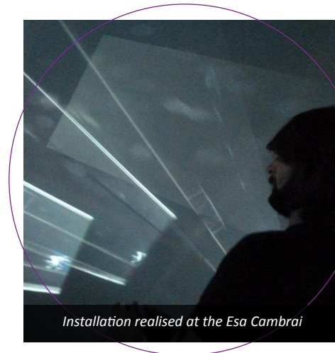
Installation realised at the Esa Cambrai

Each step of the workshop can enable everyone to fit into a creative process: writing dialogue and scenes, set design, characters, direction of virtual actors, video editing, sound mixing and put online film made on a video platform.