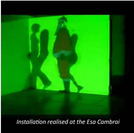
Installation realised at the Esa Cambrai