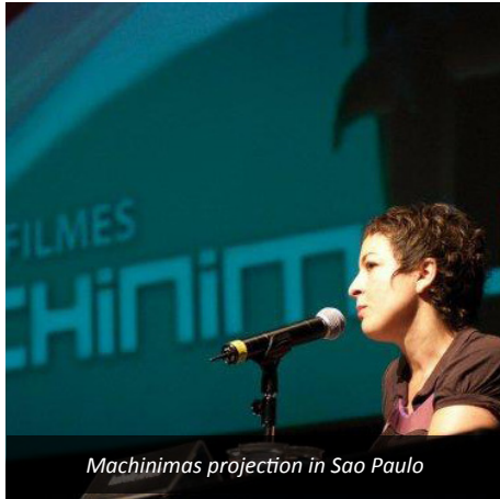
Machinimas projection in Sao Paulo